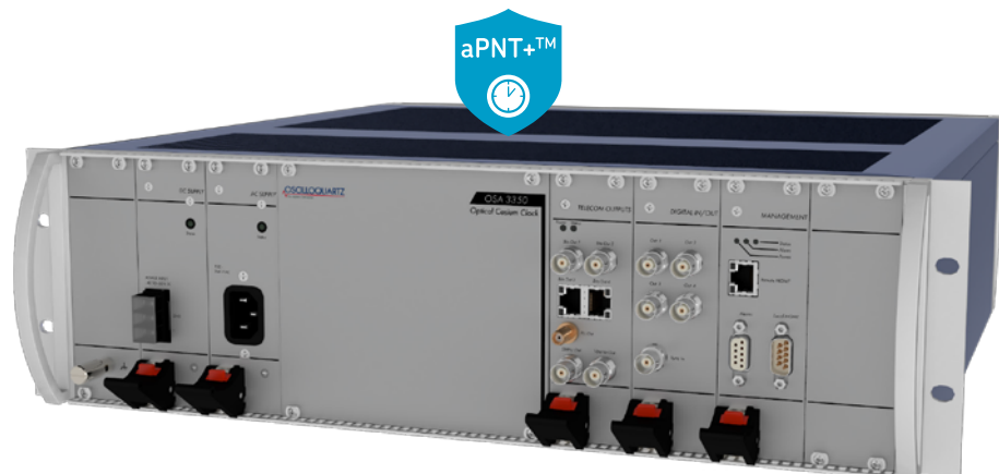
Oscilloquartz super aPNT+™ holdover cesium clock

OSA 3350 family redefines the capabilities of ePRTC, unlocking new possibilities in their respective domains by maintaining up to 100 nanoseconds of precision for 100 days. They provide continuous, accurate timing even in environments without GNSS, and ensure reliable synchronization for critical infrastructure and communication systems around the world. Our OSA 3350 enables the deployment of ePRC solutions, which outperform even the most stringent recommendations. What's more, complementing satellite-based synchronization solutions with ultra-stable atomic clocks ensures the highest levels of availability. Combined with a highly scalable grandmaster such as our OSA 5430 or 5440 series and the OSA ePRC solution, comply with G.8272.1 ePRC parametric holdover, our OSA 3350 enables a market-leading, resolving GNSS dependency for 4G and 5G networks.